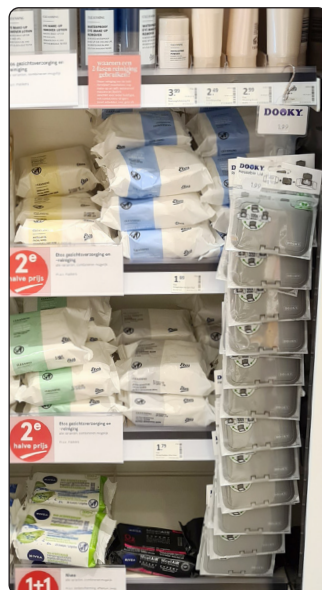
Etos (drugstores & cosmetics)