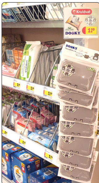
Kruidvat Drugstores (A.S Watson)