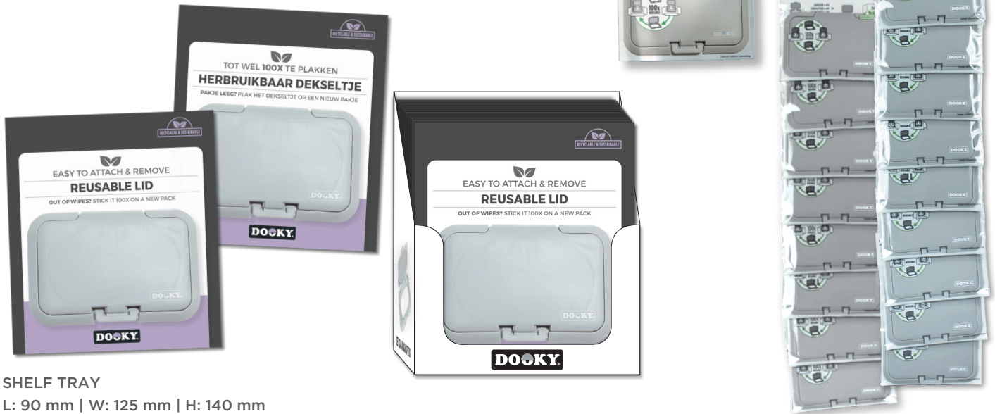
SHELF TRAY L: 90 mm | W: 125 mm | H: 140 mm